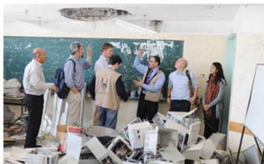
IR-Pal HoM describing to a delegation from the British Department for International Development (DFID) the repair process of a classroom in northern Gaza Strip. Through DFID funds, 20 schools which were damaged during the recent war will be renovated.